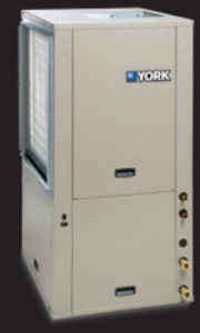
VERTICAL AND HORIZONTAL MODELS AVAILABLE