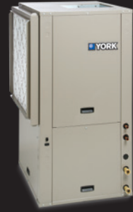
VERTICAL AND HORIZONTAL MODELS AVAILABLE