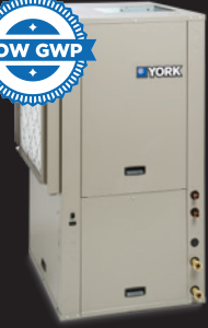
VERTICAL AND HORIZONTAL MODELS AVAILABLE